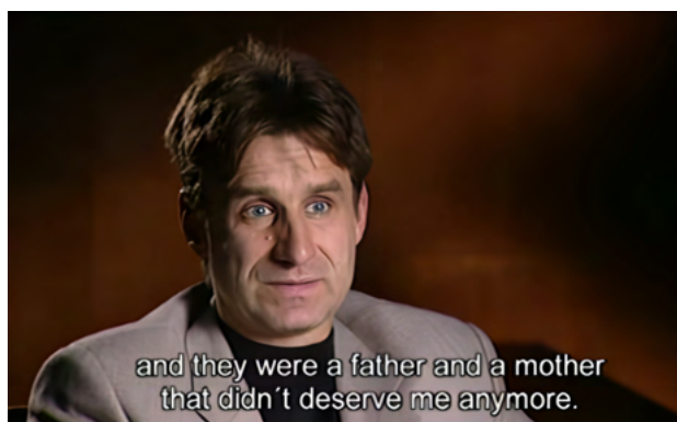
A member of the firing squad and child of the decree

him as their symbolic father, were largely children of the decree. One of them describes, in “Children of the Decree”, the psychological shift that crossed his mind while tying Ceaușescu’s hands before the shooting with these words: “They were a father and a mother that didn’t deserve me anymore”. The generation born out of the decree ultimately toppled Ceaușescu’s rule. The legacy of 25 years of socialist regime made the old generation anesthetized, most likely scared of taking the streets, while the new one showed signs of change.