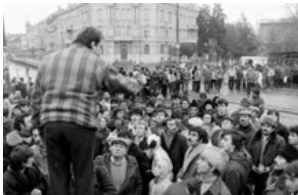
December 1989 demonstration in Timișoara

In the mid-1980s, as the Romanian leader's grip on power waned and pro-natalist policies lost efficacy, he resorted to even more draconian measures to control women's reproductive rights. In 1986, he declared the unborn fetus as part of a socialist society, motherhood a patriotic duty, and refusal to bear children a crime. At the same time, Romania had the highest maternal mortality rate in Europe, with 159 deaths per 100,000 live births, with approximately 87% attributed to unsafe abortion methods (Hord et al., 1991).