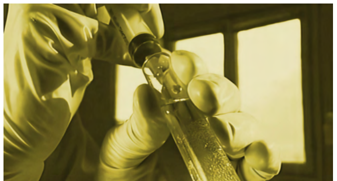
Pregnancy test used by the regime to investigate early pregnancy stages among women

S ecuritate's modus operandi was grim: subject the suffering women to mental and physical torment, extract confessions regarding their abortion providers, and, if deemed necessary, let them perish in the quest for truth. Many women would claim self-inflicted abortion procedures. Occasionally police officers would authorize emergency curettages, observing the procedure firsthand. The psychological duress, compounded by fear, weighed heavily on both doctors and women. Working women were also subjected to monthly gynecological control to detect early pregnancy and monitored until birth impeding any chance of abortion. In 1974, Romania was lauded as a paradigm of population expansion, and even selected by the UN to host the World Conference on Demography and Development. Bolstered by increasing external support from the West and good relations with the Soviet Union, Ceaușescu persisted in his nationalist crusade, ruthlessly sacrificing the lives of Romanian women.