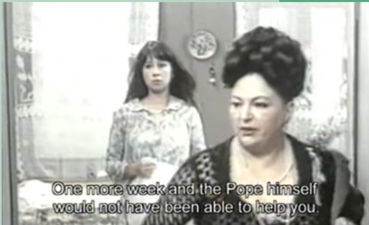
Laura and Titina in "Ilustrate cu flori de câmp"