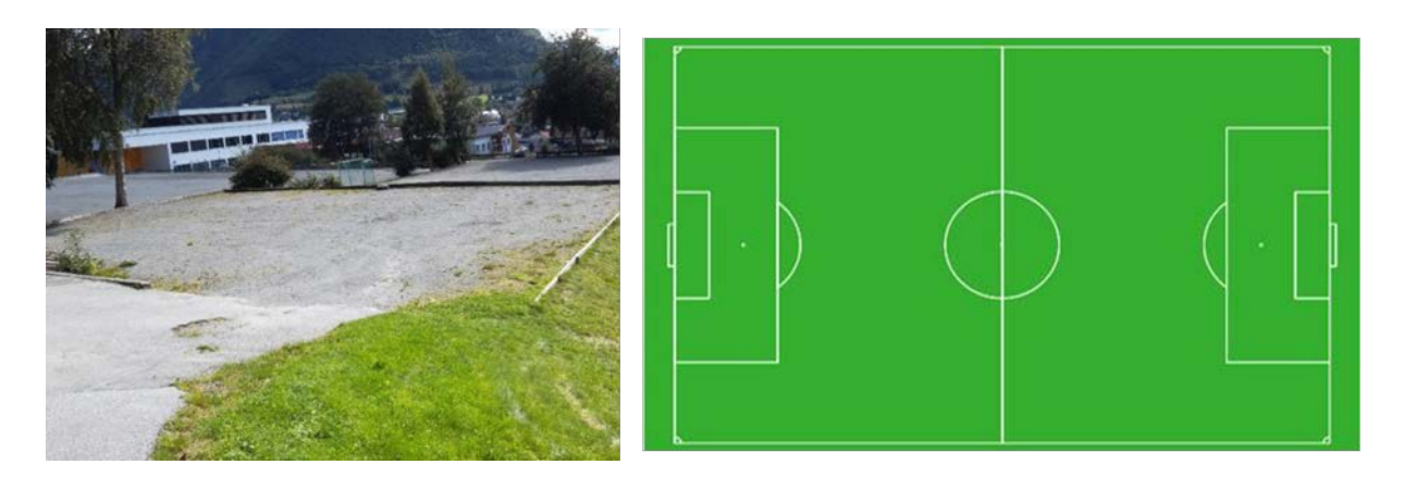
Figure 6. Ola presented his picture to the whole class and sketched the lines of a football pitch.