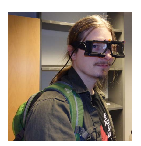
Figure 1. Gaze-tracking gear.

In the elementary teacher group we chose two students to wear eye-tracking glasses (Figure 1) and microphones during three short walks outside school (one walk before, one during, and one after the photography activity) and during the group discussion. In addition, we made video recordings of the group activity and whole class activity. After the activity, we had stimulated recall interviews with these two students to obtain more information about their perception during the time they were wearing the glasses.