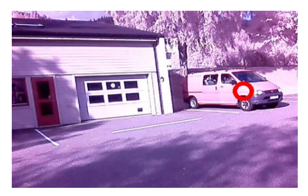
Figure 3. Estimated gaze point

Outdoor lighting conditions, especially direct sunlight, poses some challenges in the gaze tracking; pupil size decreases, extra reflections occur, the eye camera image may totally saturate, and the participants squint the eyes, all of which contribute to a deterioration the eye data. Hence, to avoid direct sunlight, we chose a shady path and the participants wore caps.