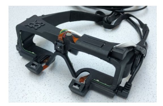
Figure 2. The gaze tracking glasses used in the study

Two voluntary students wore the gaze- tracking glasses (Figure 2), connected to a laptop carried in a backpack. The glasses contain three cameras; two pointing towards the eyes and the third one recording users scene. The software computes the gaze point (Figure 3) in the scene camera, using the eye camera data. In order to obtain good quality eye data, the students should have normal vision (no glasses/contact lenses or strabismus). Moreover, they could not use mascara.