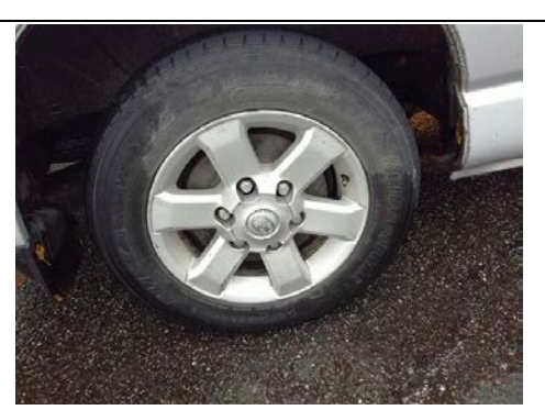
Table 2. Examples - Photographs and mathematical concepts

The question is which mathematical concepts students can learn. Our participants gave possible applications to mathematics education (see the examples in Table 2) and emphasised that they could design tasks at all different levels.